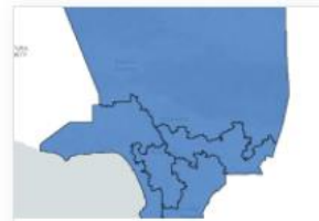
Option F-1 (ESRI Layer View)

Note: This conceptual map does not pass deviation integrity test. Commissioners..