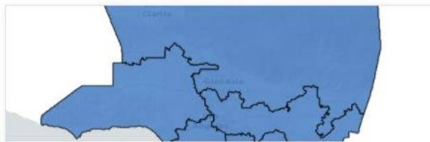
Option G (ESRI Layer View)