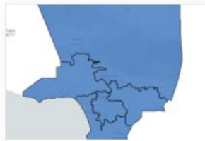
Option B-2 (ESRI Layer View)