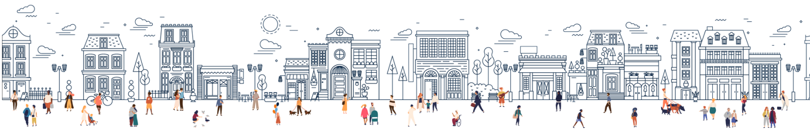
EXHIBIT: RESOLUTION NO. 2021-02