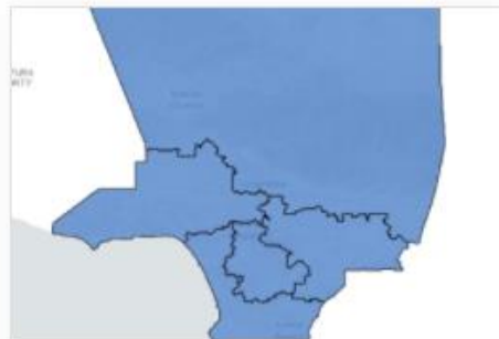
Option B (ESRI Layer View)