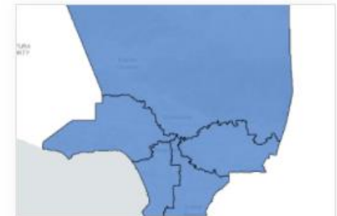
Option D (ESRI Layer View)