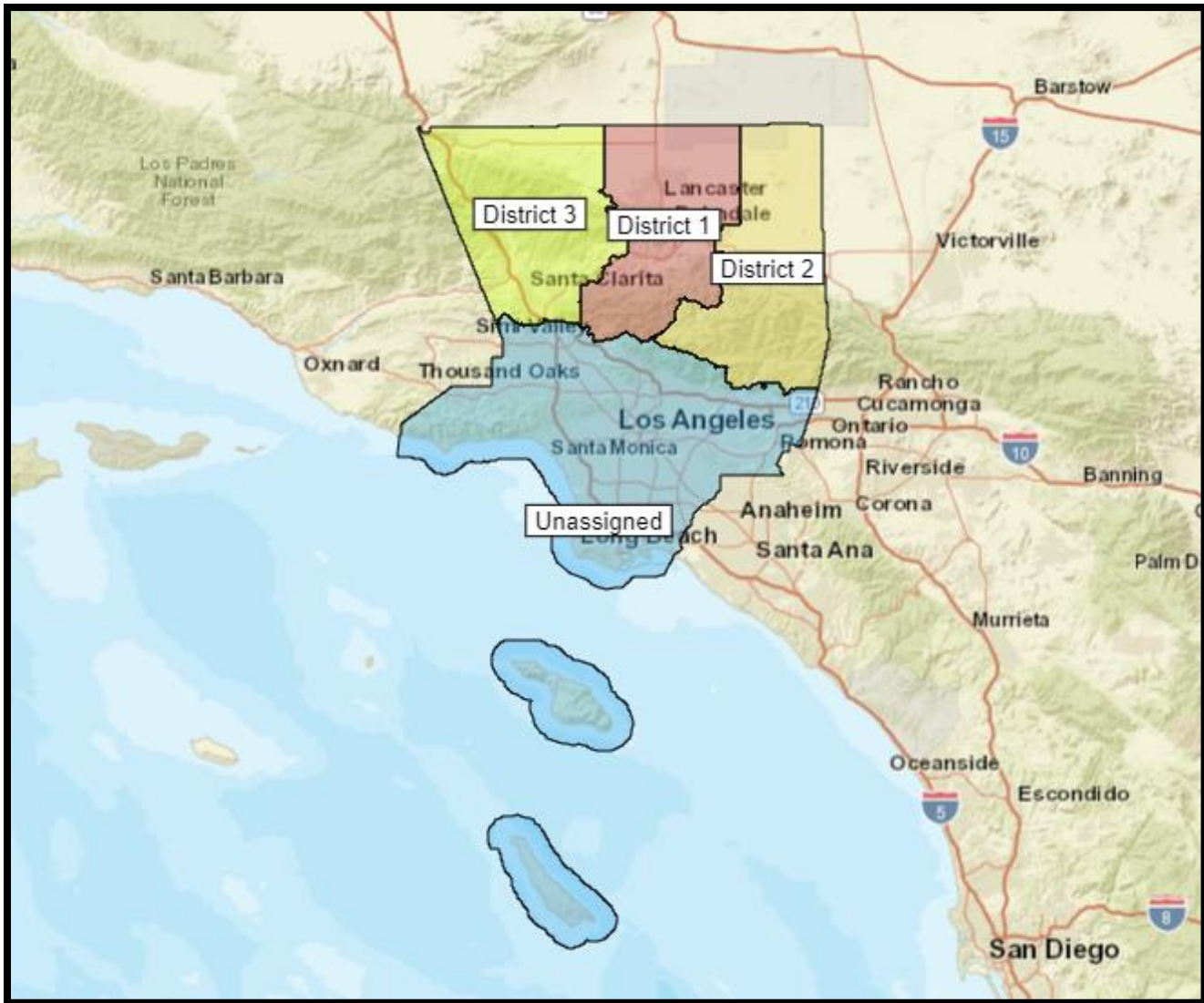
Illustration 1. Team 3 provided a shape map of the "Three Stripes" hypotheses for North County/Antelope Valley. Team 3 also provided other supplemental maps that are posted on the LA County CRC website under this agenda item.