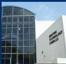
ATA / ATB