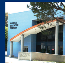
PEC / N / S