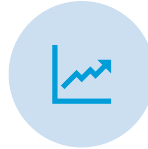
Los Angeles County Utilization Plan for LSBE, DVBE, and Social Enterprises