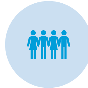
Los Angeles County 2020 Census