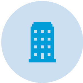
Los Angeles City Development Reform