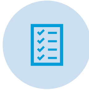
Los Angeles County MAPP