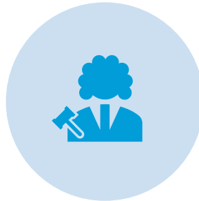
Los Angeles County Civil Grand Jury